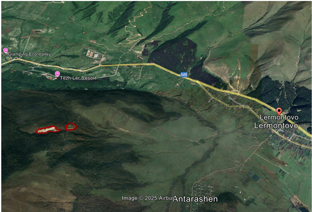
Figure 1: Location of Tandzut former mine site

A review of analytical data carried out during a previous environmental assessment will be essential to guide a risk-based remediation approach. Actions should be emphasized that focus on containing risks and hazards that could impact off-site receptors: potential examples are the transport of toxic heavy metals through surface water runoff; impacts on aquatic eco-systems and food chain through water as a pathway; and wind-blown dust from the site. The measures proposed for this site should prioritize and maximize the role of natural attenuation processes for the actual mine site, and the containment of identified, significant hazards that could reach sensitive receptors. The key environmental risks and hazards associated with the existing mine sites include: